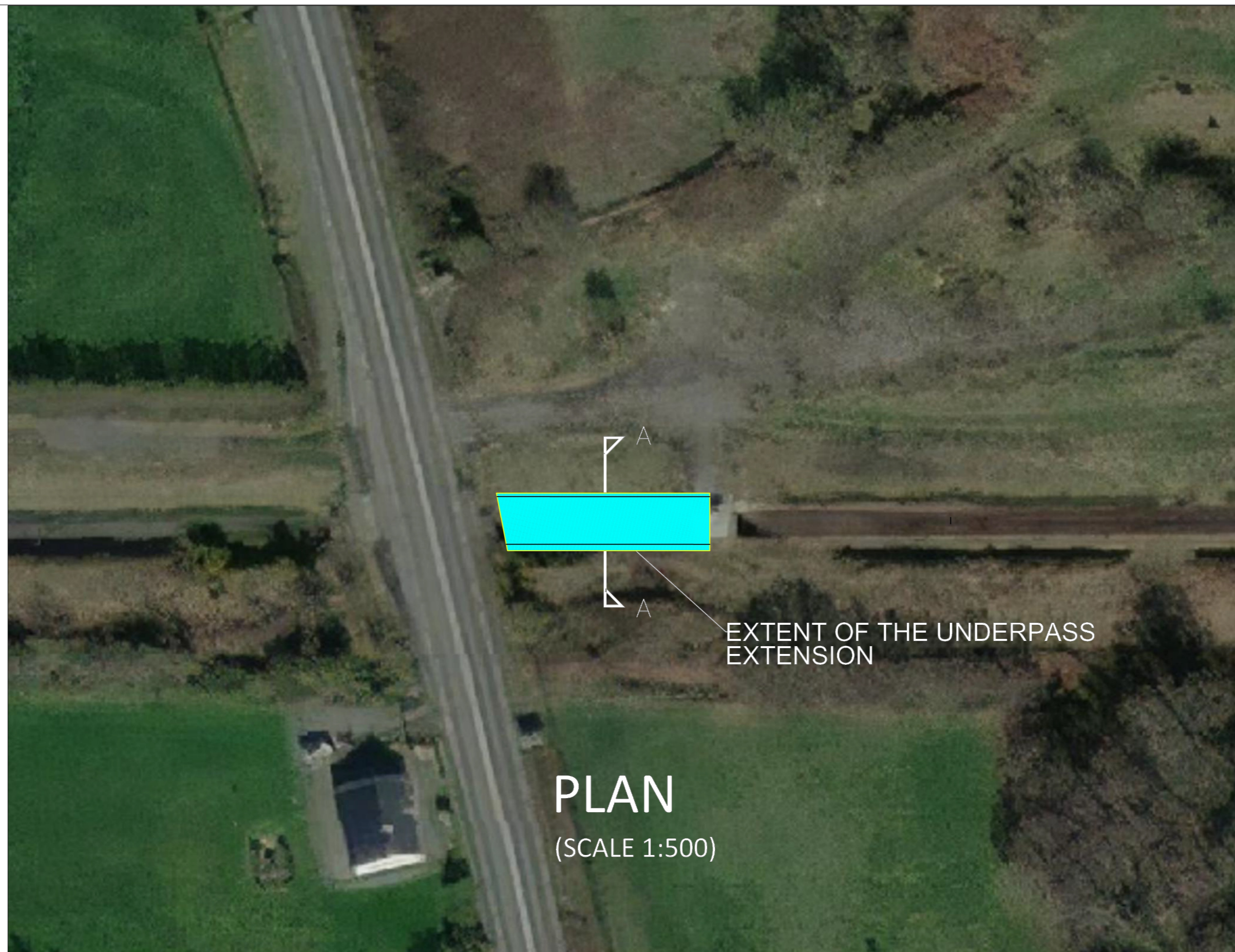
PLAN (SCALE 1:500)

Drawing Notes 1. Drawing Status: Planning Stage Only - This drawing is intended for concept development and preliminary review and does not represent final or detailed design specifications.